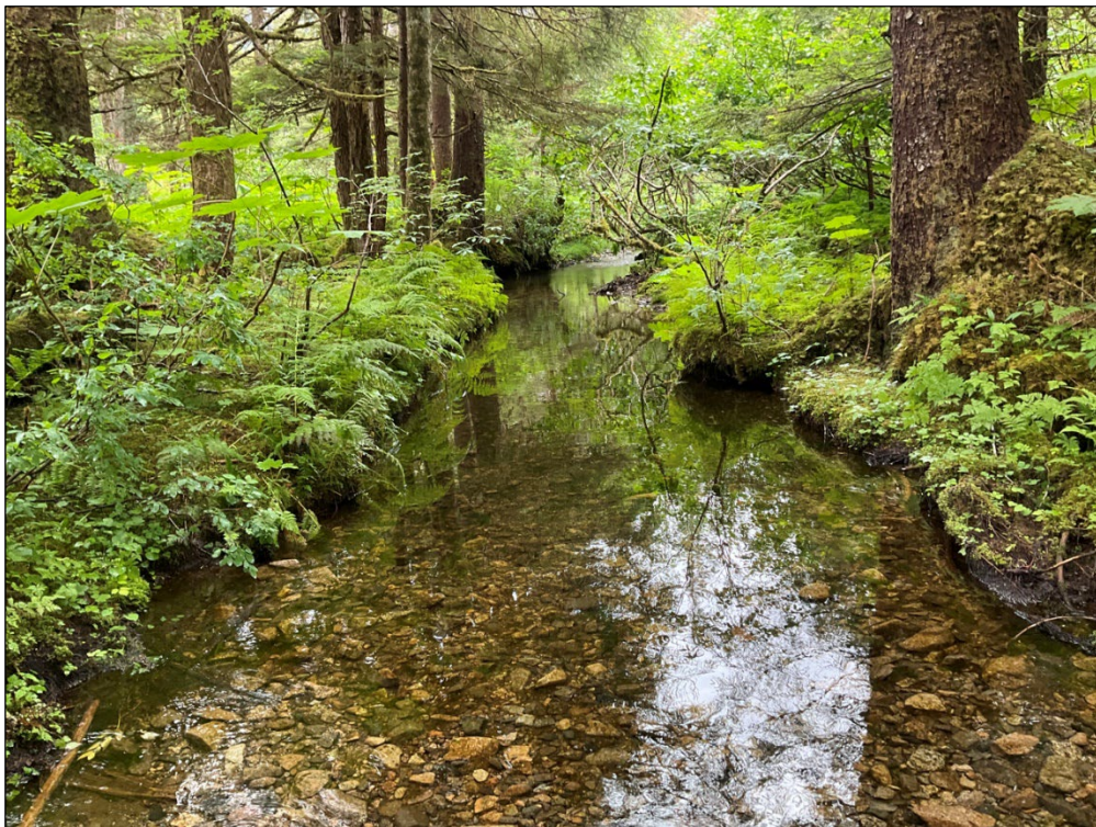
Figure 2.—Channel upstream of waypoint 1246.