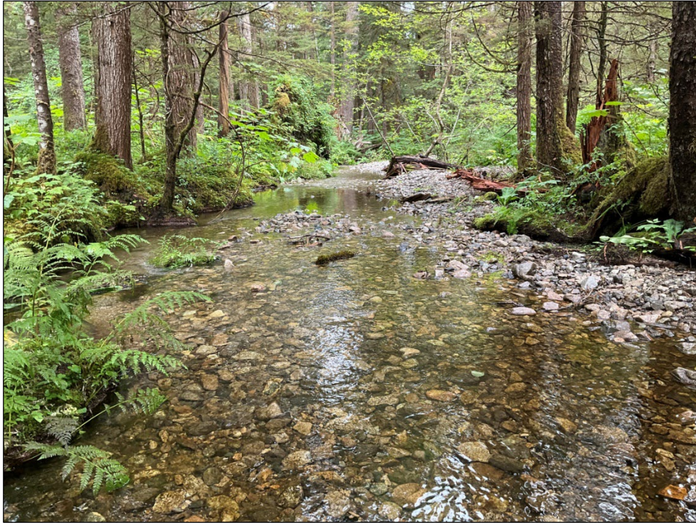
Figure 1.—Channel downstream of waypoint 1246.